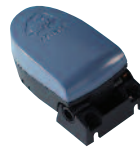
BE9002 Floatswitch suitable for use with 12 V d.c. or 24 V d.c. pumps Note: (Up to 15 amp rated 500, 950, 1300 Orca models)

Whale high quality bilge accessories including electric bilge switches, non-return valves, elbows and Y pieces. Page 48 - 51