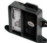
BE9003 Electric field sensor switch suitable for use with 12V d.c. or 24 V d.c. pumps